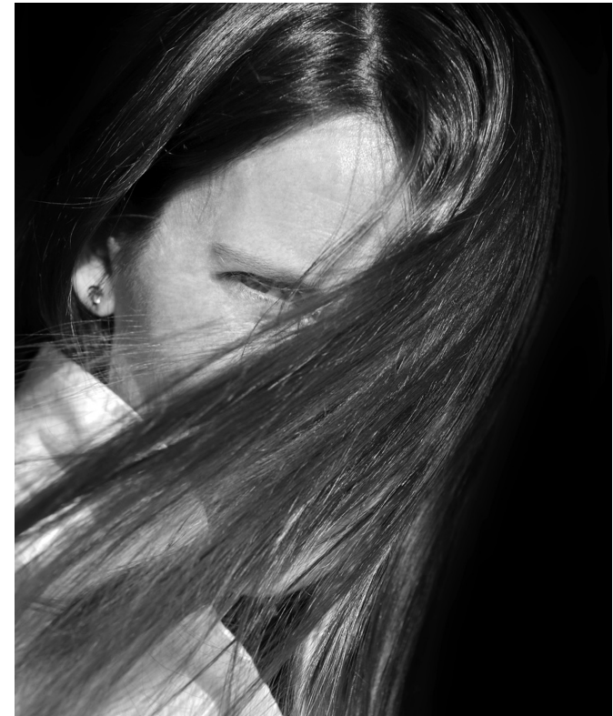
Pascale Berthelot