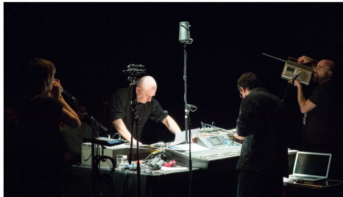
Les Voix Magnétiques