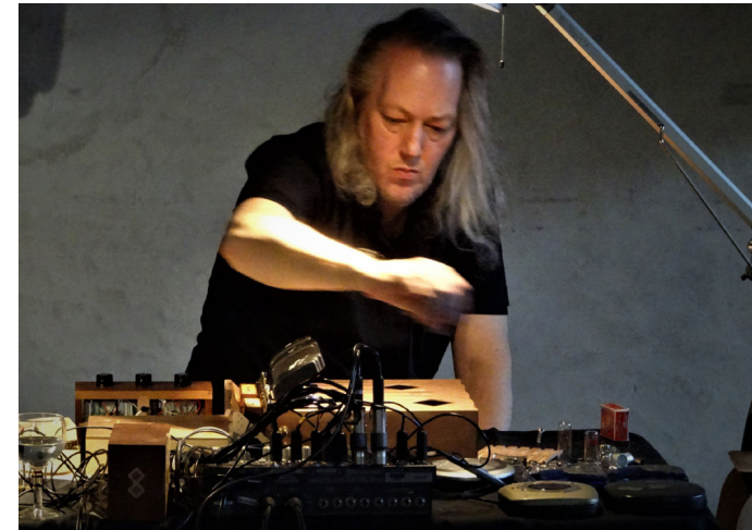
Lee Patterson

Lee Patterson always takes us on very exciting journeys. His music ranges from large soundscapes to tiny amplified objects. These small objects are just astonishing and surprising: boiling chalk, vibrating metal springs, burning seeds, sparkling water in cristal glasses... These small and tiny figures just appearing silent come to life. The second performance will close the festival. Yes!